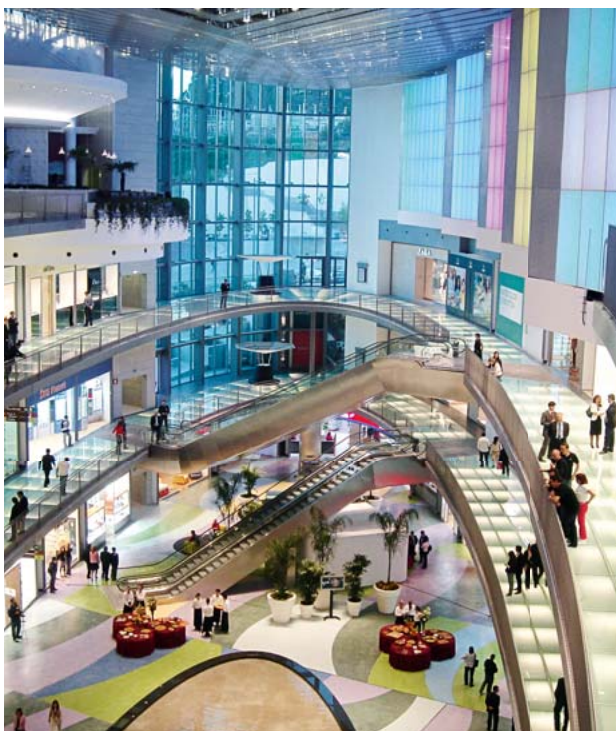
DIM electronic ballast: Dolce Vita shopping center in Porto, Portugal