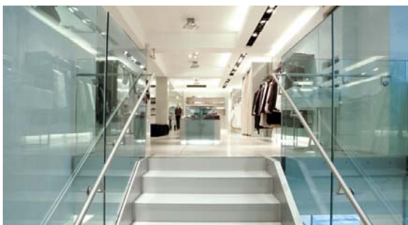
PTi sales room Hallhuber in Munich, Germany