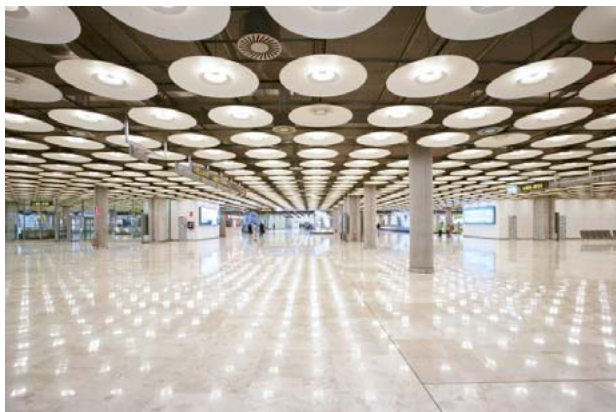
Electronic ballasts and ring-shaped fluorescent lamps: Barajas Airport in Madrid, Spain

*The system guarantee is processed by OSRAM directly. For terms and details see www.osram.com/system-guarantee