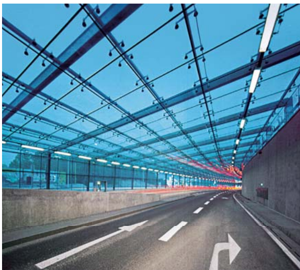
DIM electronic ballasts in constant use: Petuel Tunnel in Munich, Germany