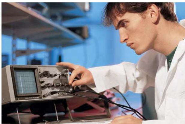
Continuous research and development