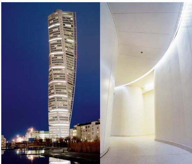
LED and OPTOTRONIC®: Turning Torso in Malmö, Sweden