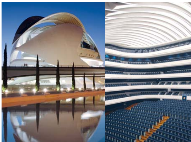
DALI electronic ballast: Palau de les Arts de València in Valencia, Spain