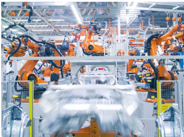
T5 electronic ballast: Audi body work construction Audi TT in Ingolstadt, Germany